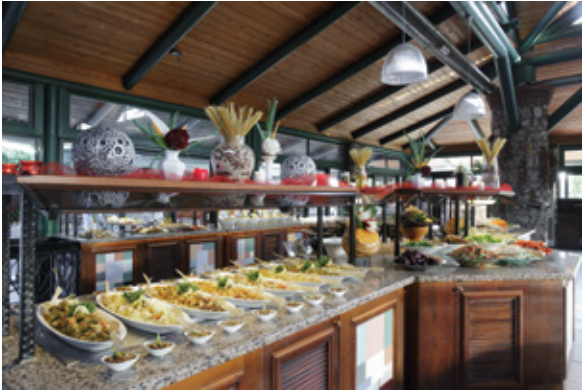
Kapadokya & Terrace Restaurant