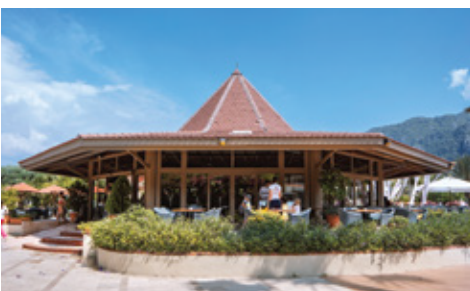
Otag Bar ( Mimoza & Mediterranean Fish Restaurant )