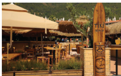
Tiki Beach Restaurant & Bar