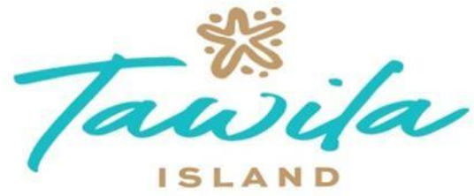
Tawila Island Resort Entrance