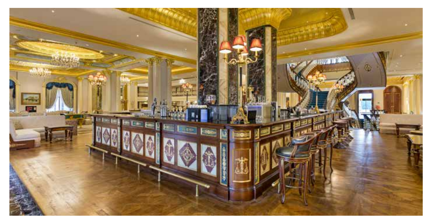
BARS SUMMER SEASON