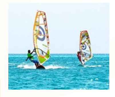
LEISURE AND ACTIVITIES

For those wishing to ease try the soft animation with volleyball, stretching and water activities like aqua gym, water polo and more fitness programs and team building options upon request. Daily varying evening shows and for those wishing to get the ultimate experience "Point Break" watersports station offering kite surfing, windsurfing, sailing, wakeboard and a diving center offering diving trips are on site with experienced instructors and modern equipment. The resort provides professional tennis services on spot with 4 tennis courts, mini golf course as well its own Horse Stable and Jumping Arena with a selection of Arabian horses to include every level of entertainment.