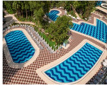
Pool3(top left), 4(middle), 5(top right)