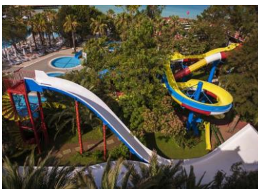
Aqua Pool 3