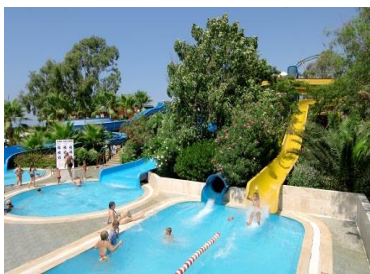
Aqua Pool 1