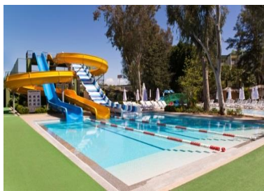
Aqua Pool 2