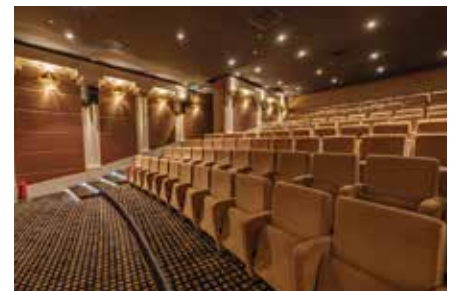
Moviola Movie Theatre