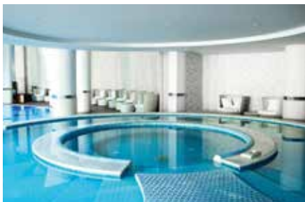
Indoor Pool with Jacuzzi