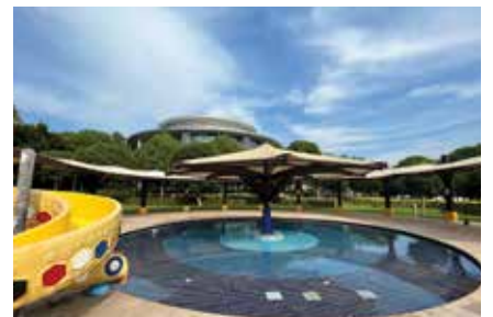
Outdoor Swimming Pools for Kids