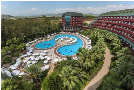
Pool 1 (Relax Pool)