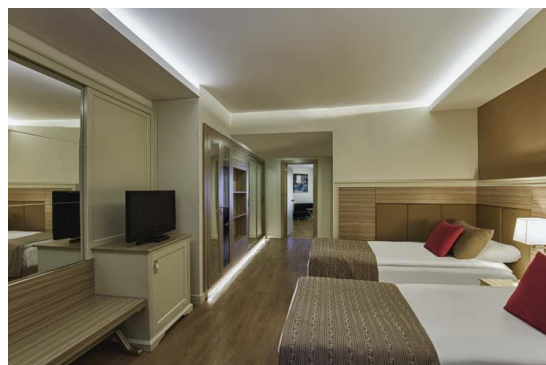
Family Room (Children)

Family Room: 43 m 2 . There is 1 parents room (1 french bed + 1 sofa), 1 children room (2 Single bed), LCD-TV, shower / WC, minibar, telephone, laminate flooring, balcony, safe, hair dryer Everyday: room cleaning, change of towels. Once Every 2 days: change of bed linen (Accommodation maximum: 3+2 or 4+1) (Sofa Bed: 179 x 75 cm).