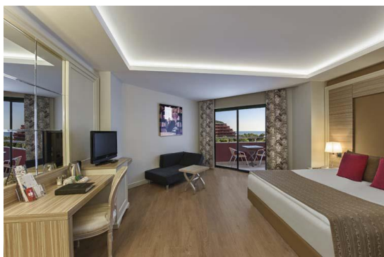
Family Room (Parents)

Technical Details Hotel for Disabled Guests: in total 5 rooms, have the same features as the standard rooms, an emergency button, shower / WC are available. The rooms have Land View. Technical details: door 80 cm, balcony door: 85 cm, elevator door: 80 cm, bathroom door: 80 cm. The reception, restaurants, swimming pools and the beach are accessible with a wheelchair.