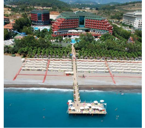
Main Building and Annex Building