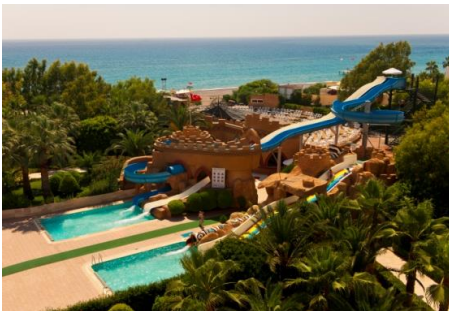
Pool with Water Slides 1 and 2